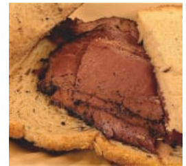
20 of the Worst Foods for Diabetics