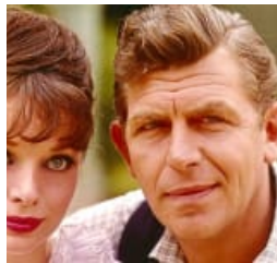
Almost Nobody Aces 'The Andy Griffith Show' Quiz