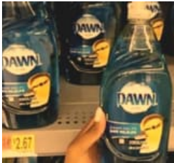
Put Dish Soap in Your Toilet Tonight - Here's Why