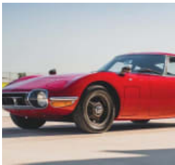
97% of Men Can't Pass This 1960s Car Quiz