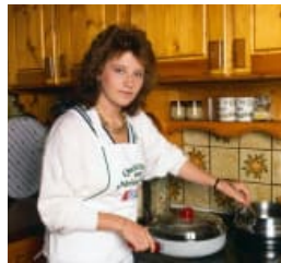
What the American Kitchen Looked Like the Year You Were Born