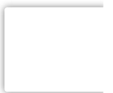
Photo: LA JOYA, TEXAS - APRIL 10: Unaccompanied minors (L), are grouped apart from families waiting to be processed by U.S. Border Patrol agents near the U.S.-Mexico border on April 10, 2021 in La Joya, Texas. A surge of immigrants crossing into the United States, including record numbers of children, continues along the southern border.