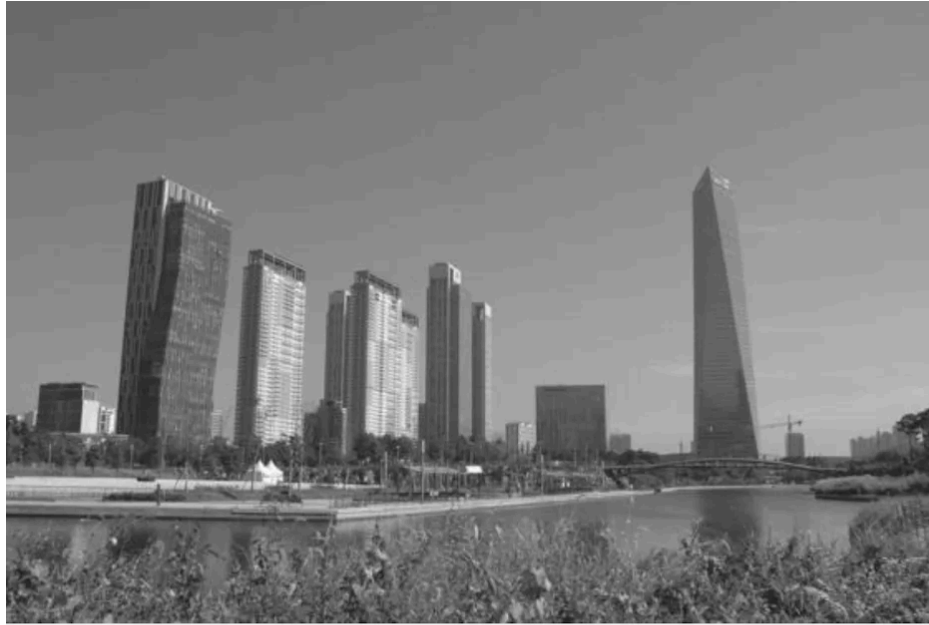
The smart city Songdo, South Korea, is built in the International Style, following the outdated urban ideals of Le Corbusier (note the similarity between Posco Tower to the right and the new One World Trade Center in New York).

“Traffic flow and citizen behaviour is monitored in real-time via five hundred surveillance cameras. Household waste is automatically transported via the pneumatic system under the city and converted into energy. All apartments have smart locks, with smart cards which can also be used for loaner bikes, parking, subway, and movie tickets. All apartments have smart meters (enabling residents to compare their energy consumption with that of their neighbors) and built-in cameras everywhere. Floor sensors detect pressure changes and automatically alert an alarm service of a suspected fall. Systems are tested where residents via the TV screen can receive language lessons or communicate with their physician as well as neighbors and relatives, and bracelets for locating children via GPS. 7 In other words, a futuristic dream straight out of the World Future Society’s 1970s vision—or Orwell’s 1984. And this is South Korea. How successful, environmentally friendly, and inclusive Songdo really turned out to be has been questioned. It was built primarily for an affluent middle class expected to be able to afford the higher standard and the new technology. The electricity comes from coal-fired power plants and the buildings are completely glazed with windows that cannot be opened, which requires air conditioning all year round. 8 Also, the pneumatic waste disposal system does not always work properly. As of March 2018 there was still no cultural life, no street