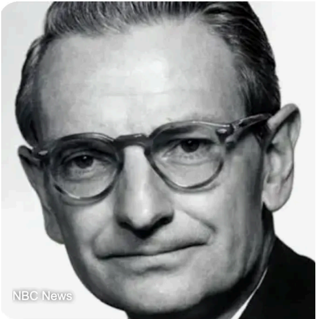
This man created the New Age, the climate scare and the Sixth Great Extinction scare

He stood up and funded most of the New Age gurus followed today by tens of millions, if not hundreds of millions. The New Age says “Stay out of the battleground, don’t worry about your neighbor, your family, your town, your country. Worry about your personal spiritual advancement, your tolerance and forgiveness. Work on yourself. Do your shadow work”, you are everything, everything is a reflection of you.”