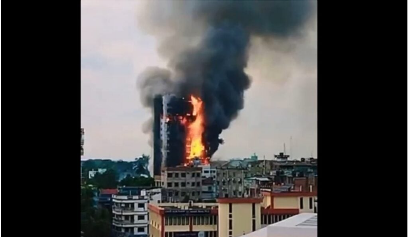
The Zanbeer International Hotel is burning in Bangladesh

The US Agency for Global Media's Voice of America supported a boycott of elections in January, which Hasina won. State Department spokesman Mathew Miller then claimed the election was "not free or fair."