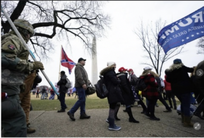
1 of 4 | FILE— In this Jan. 6, 2021, file photo, Trump supporters gather on the Washington Monument grounds in advance of a rally in Washington, both within and outside the walls of the Capitol. Banners and symbols of white supremacy and anti-government extremism were displayed as an insurrectionist mob swarmed the U.S. Capitol. FILE