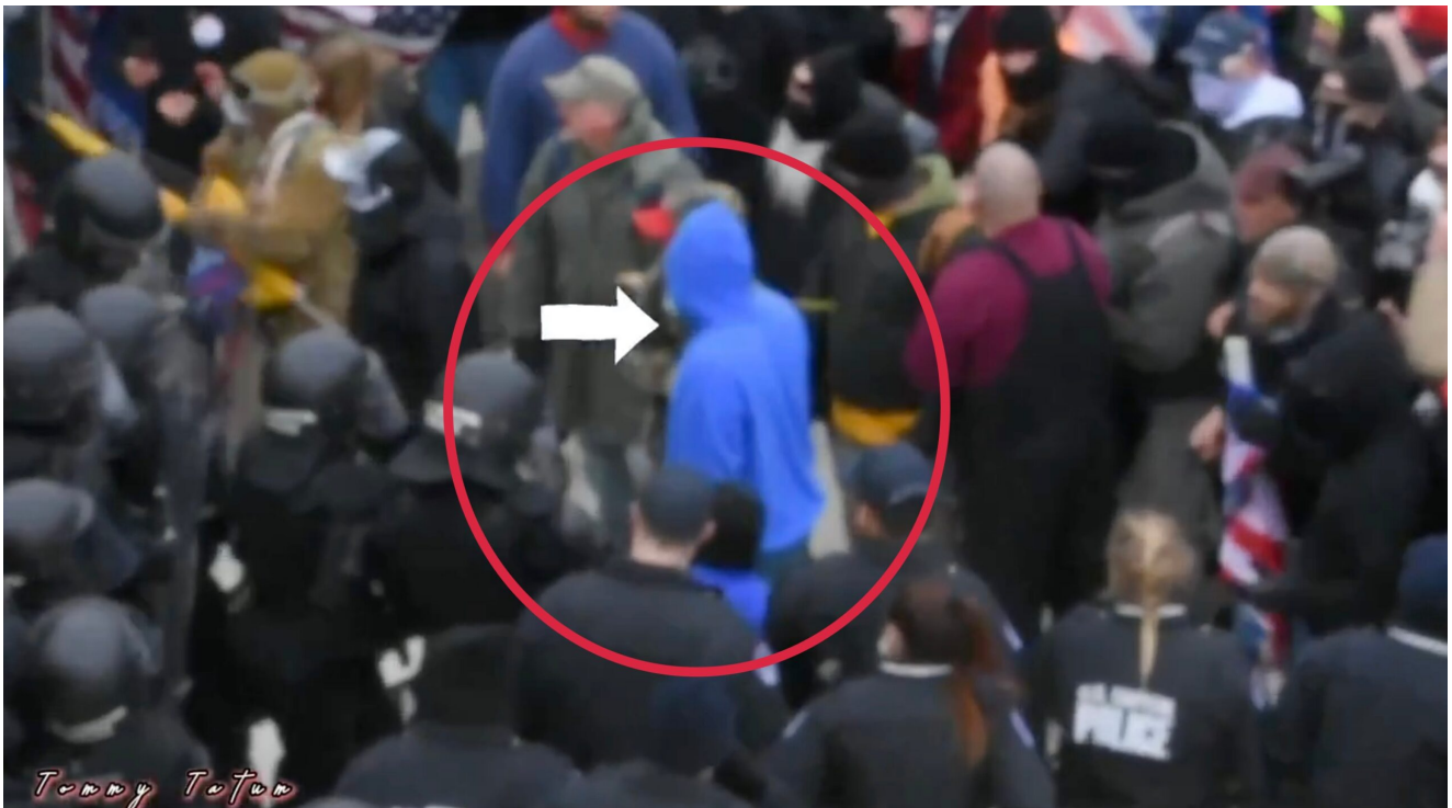
The next bullet hit three different men starting with the man in the blue hoodie.