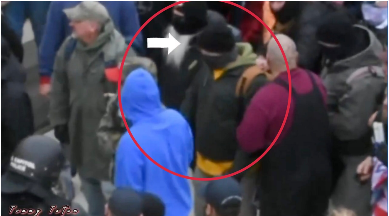
The bullet then ricocheted into a second man and hit the victim in the head.