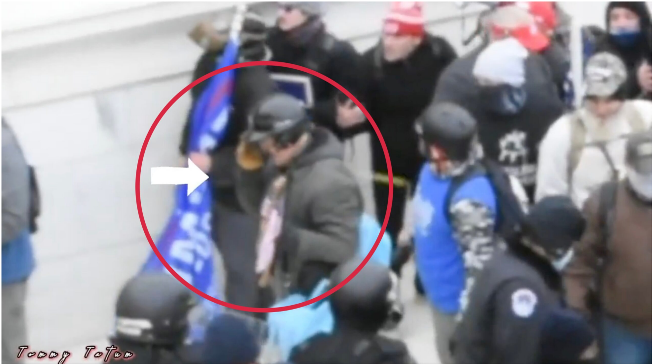
The third victim was shot in the face. You can see the bullet in the air before it struck his face.