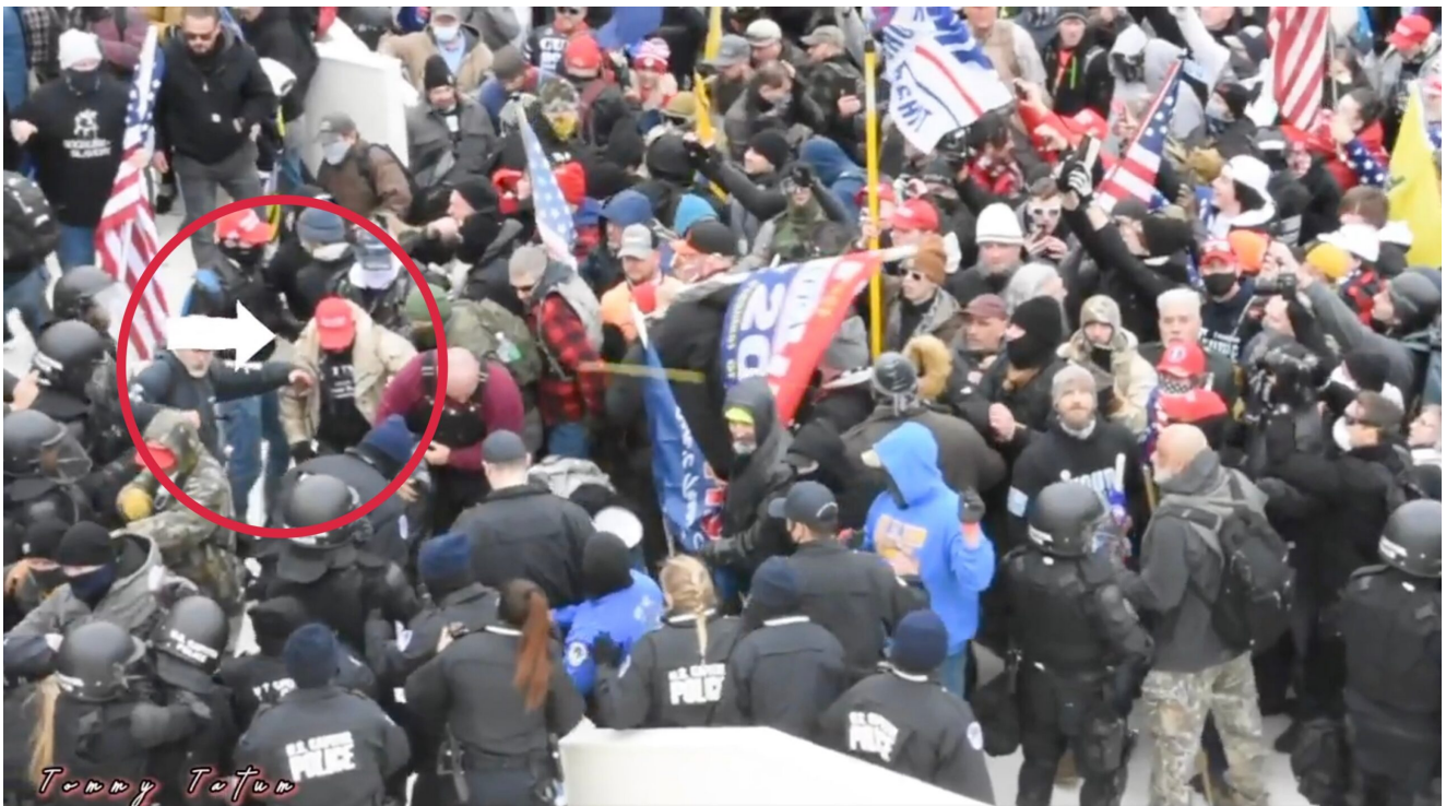
The second victim was shot in the side of the head below his hat without warning. Still, the protesters DID NOT RIOT.