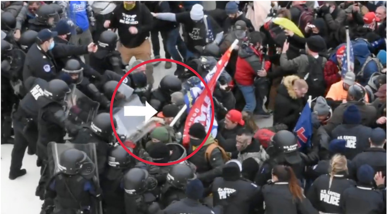
The first victim who was shot had his hat knocked off his head.