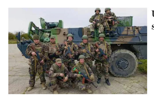
Ukrainian soldiers trained by French army go AWOL before shot fired